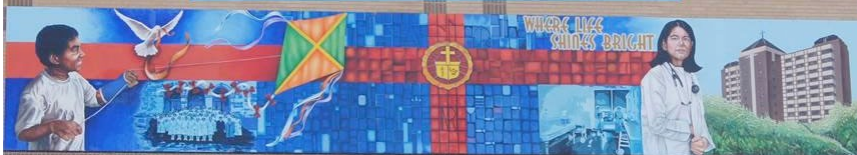
Council 8157 Cookout – June 9, 2013